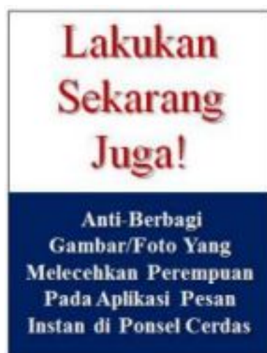
Figure 3. Anti-Bullying Campaign Women.

Potential formation of perceptions Wrongly as modeled on the Two images above need to be prevented by The way in between, inviting Phone users to no longer Share Pictures/Photos To visualize discrimination against Women. Driving campaigns: — anti sharing abusive images/photos For girls on the Instant messaging app Smartphone || to be the urgency necessary to Realized and immediately applied by all Parties, for each member of the community Social responsibility In state and nation. By of photo-sharing behaviour Should include social irregularities and can cause impacts Social harm in the community, As well as forming cultural perception Wrong. Direct impact Human rights violations, Gender injustice, degrading Dignity of others, and does not The 2nd of Pancasila was run. A fair and civilized humanity.