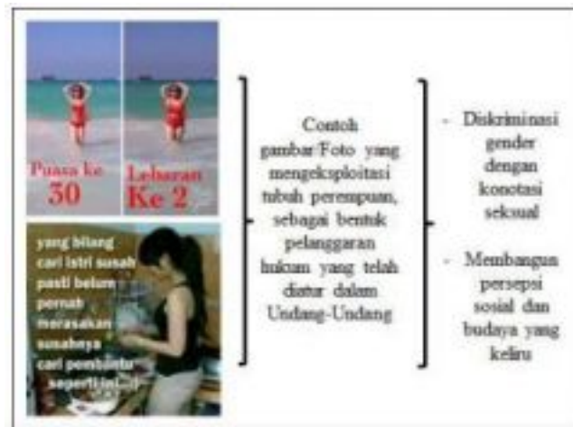
Figure 2. Sample Pictures/Photos That are shared via the Instant messaging app.

Solutions Drive Campaigns Through print media and media Audiovisual Is an effort that can Made to build awareness Communities while educating, that The behavior of making and/or sharing Pictures/photos that are harassing women On the Instant messaging app on your smartphone including unlawful conduct. Create drawings or design works Visually degrading people May pose a Erroneous interpretation and perception, whether Socially and culturally, as The following example cases: