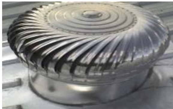
Figure 1. Turbine ventilator [6].

It is a tool that works to circulate the air in the room such as a roof fan. Unlike the case with fans such as exhaust fans that require electric power while the turbine ventilator is driven by wind [5]