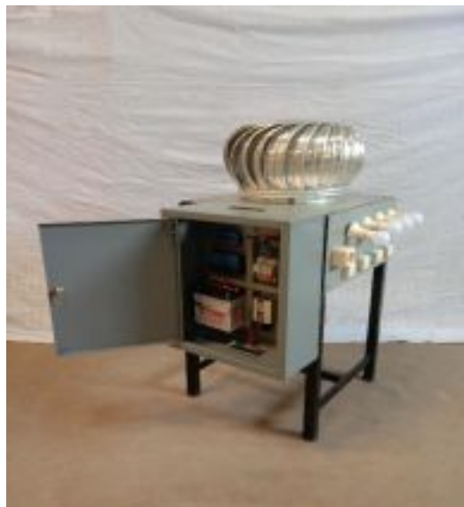
Figure 6. Ventilator as a Power Plant.

The picture 6 is a ventilator as a power plant that has been tested at different locations, but for the feasibility of generating electricity obtained location B which allows producing optimal electricity generation.