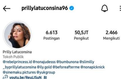
Figure 1: Instagram Official Account of Prilly Latuconsina

This study analyzes the captions of photos of endorsement products of celebgram, namely Prilly Latuconsina[7]. The captions for the pictures of endorsement products in this study focus on women's care, fashion, fast food restaurant, women's accessories, education applications, and villas[8]. The captions analysis uses the meaning field theory, which comes from semantics. In addition, below is a picture of the official Instagram account and biodata of Prilly Latuconsina[9].