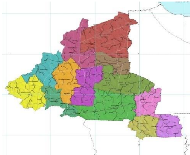
Figure 1. Tangerang City Location

management. At the start of the research, the apartment complex did not have an association of owners and residents.